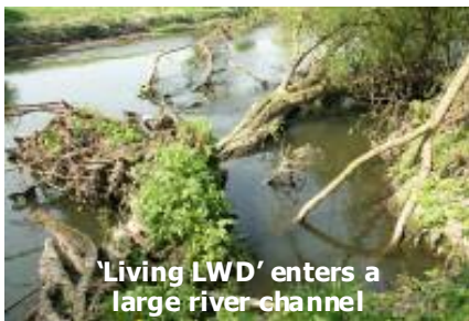
'Living LWD' enters a large river channel

River islands or braided channels are rare due to past land drainage works and a lack of naturally occurring LWD. Islands and their associated habitats support a range of biodiversity and it is time to identify areas where large rivers can be restored to their former character.