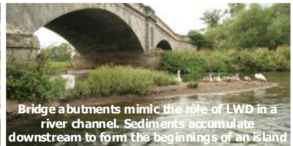
Bridge abutments mimic the rôle of LWD in a river channel. Sediments accumulate downstream to form the beginnings of an island