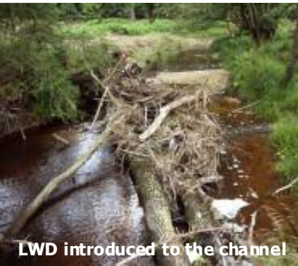
LWD introduced to the channel

Objectives To restore 600 hectares of wetland habitat, in part, by re-connecting watercourses with their former channels. To restore ten kilometres of damaged watercourse.