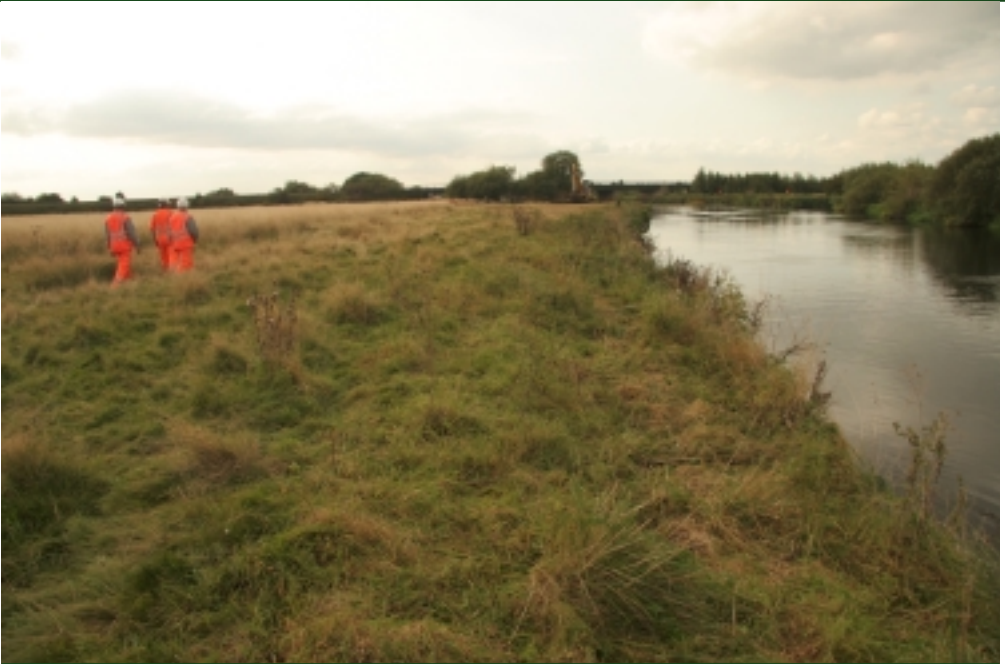
September 2009. The River Trent at Croxall prior to the works.