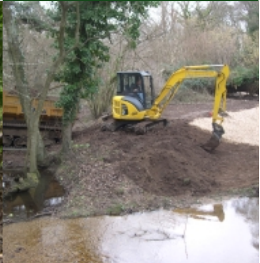
A new channel was excavated and river re-profiling carried out.