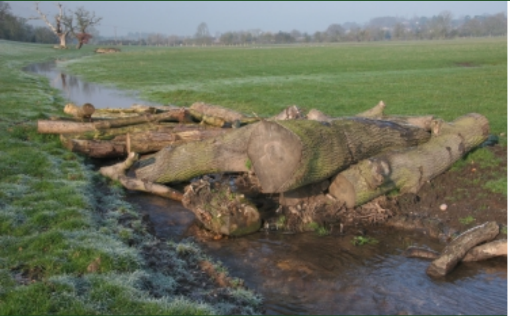
One of the constructed log jams along the newly diverted brook.