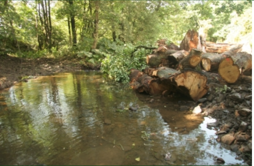
View of the completed ELJ and the entrance to an old side channel.