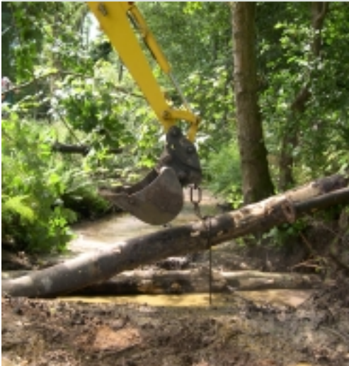
LWD was installed at a number of sites to raise riverbed levels and create additional habitats in the channel.