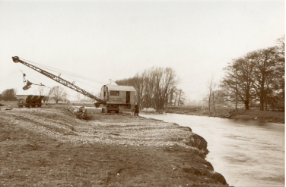
Gutted. The Trent River Catchment Board carrying out routine maintenance along the River Dove in the 1940s using a drag line. Notice the LWD removal and the creation of a trapezoidal channel.