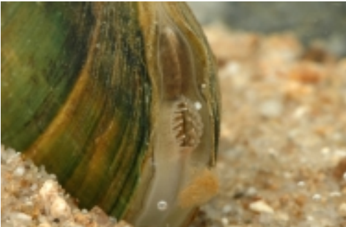
Depressed river mussel

the Southern silver stiletto fly Criorismia rustica , and the elusive water shrew.