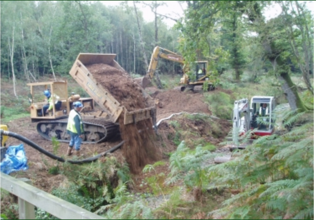
Life3 scheme at Highland Water to raise bed levels.