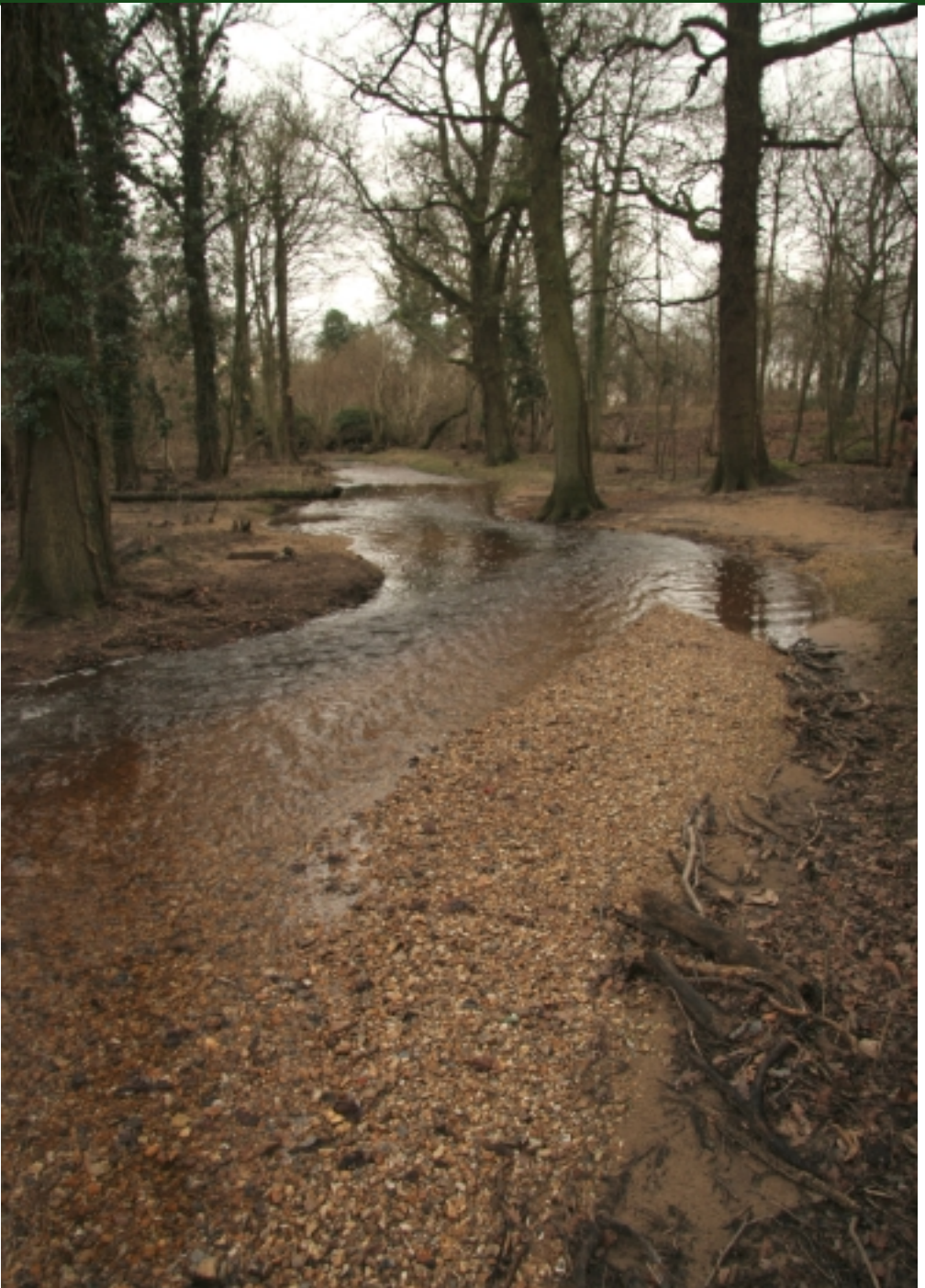
January 2008, three years on. The restoration work has been very successful. There is now a much better link between Dockens Water and its floodplain.