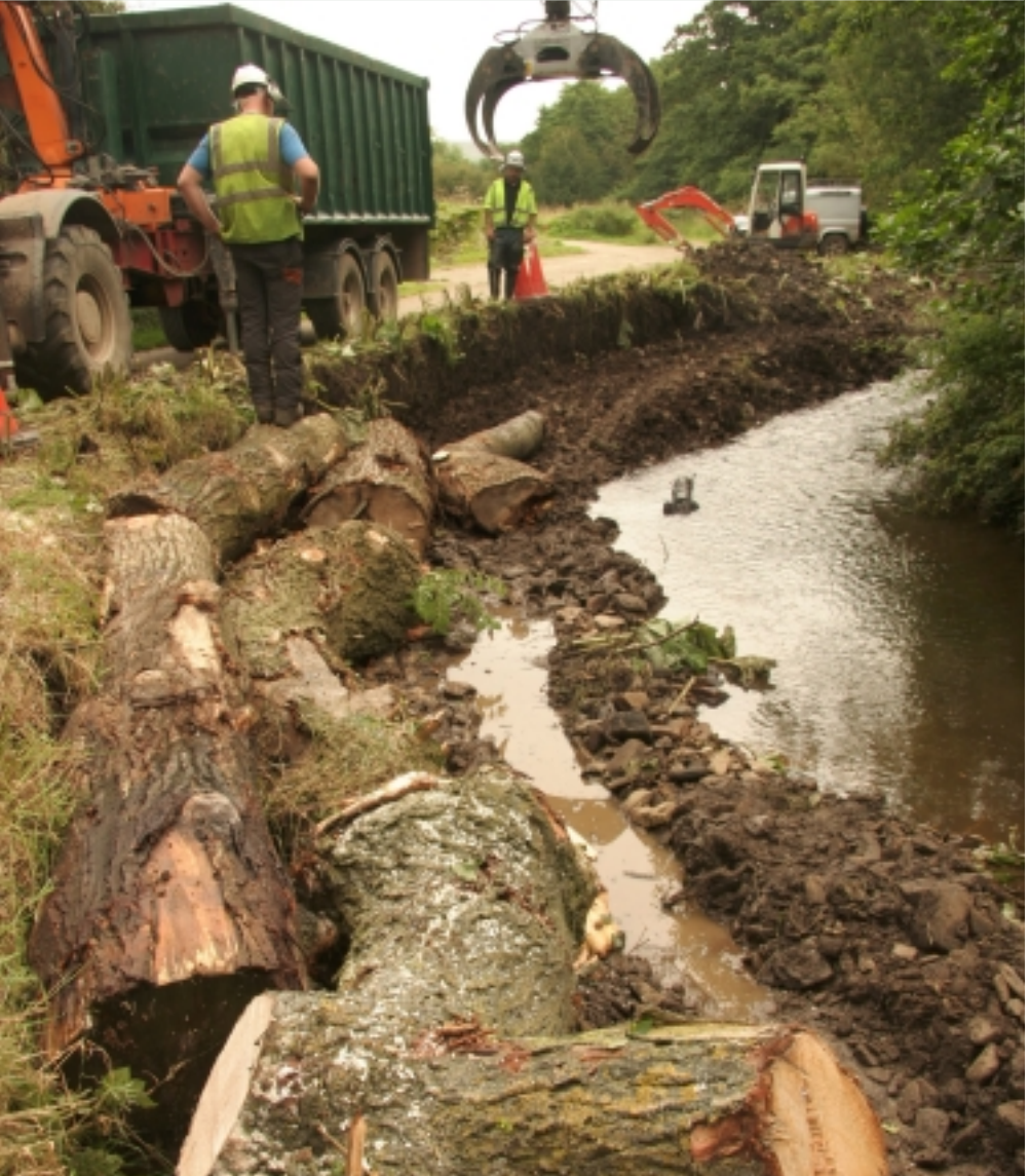
August 2009. The gabion baskets were removed and replaced with living, sprouting willow trunks.

More info: The reports relating to this scheme can be viewed at: www.staffs-wildlife.org.uk/page/tittesworth-woody-debris-project