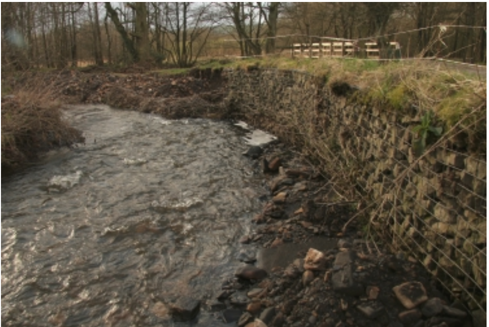
View of the collapsing gabions in 2008

The scheme was carried out in the summer of 2009. Baseline surveys of fish, vegetation, geomorphology, mammals, macro-invertebrates and stream corridor Diptera (true flies) were commissioned prior to undertaking the works.