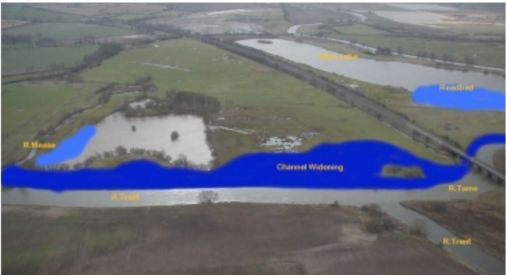
Aerial view showing the location for the river widening project.

More info: www.staffs-wildlife.org.uk/page/river-braiding-reedbed-creation