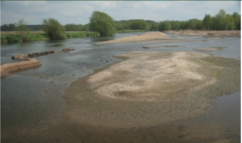
May 2010. A view of the completed river widening scheme with islands, sediment bars, backwaters and lagoons.

A measure of success. Croxall now has the potential to provide habitats for rare and locally threatened wildlife. These include the BAP species Depressed river mussel Pseudanadonta complanata ,