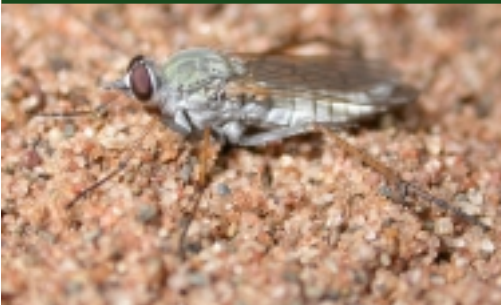
Southern silver stiletto fly