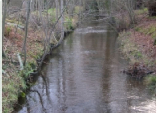
Dockens Water in 2004 shortly before the project was undertaken.