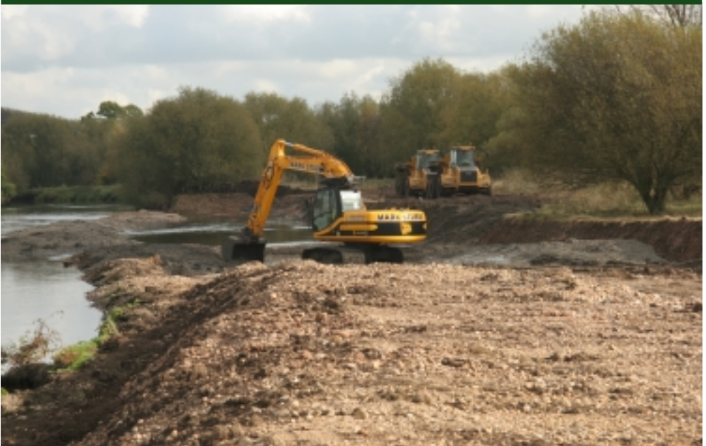
43,000 cubic metres of soil were removed during the channel widening scheme and deposited in the two lakes at the site to create substrate and shallows for new reedbeds. Gravels were retained and used to create river islands and mid-channel sediment bars.