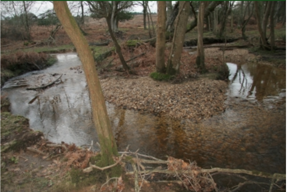
Highland Water after the restoration works.