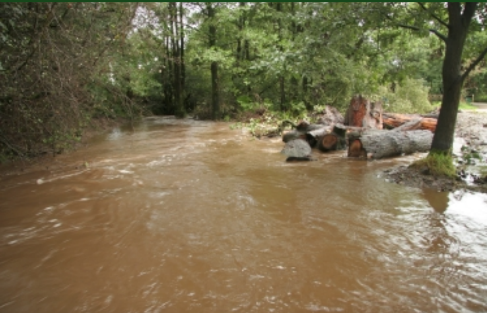
September 2009. It works! Just two weeks after the ELJ had been completed, a late summer storm resulted in spate conditions. The position of the ELJ re-activated an old channel. It is estimated that, at the peak, a third of the River Churnet's flow was diverted into this former channel.